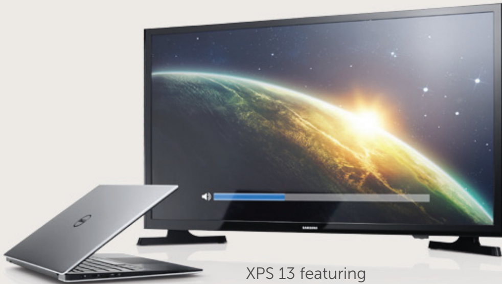
XPS 13 featuring Intel® Core™ Processors

FREE 32" Samsung TV* (a $319.99 value) when you buy a select PC $699.99+. Plus, PCs come with one year Accidental Damage Service* included.